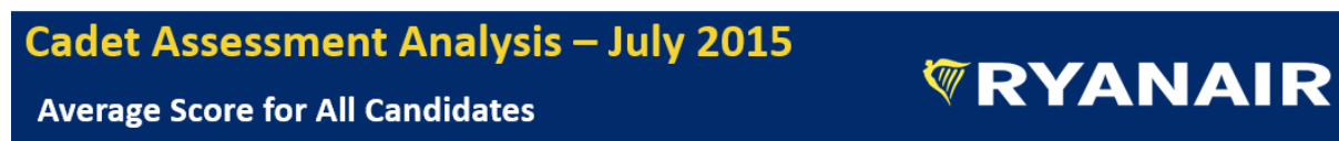
Table 1: Core Competency Scoring Among Assessment Applicants

The sample consisted of 385 candidates, all of whom had been assessed following the recent change to the nine core competencies as the assessment parameters. The pass rate of the overall sample had increased to 55% and this is within normal variance seen over many years.